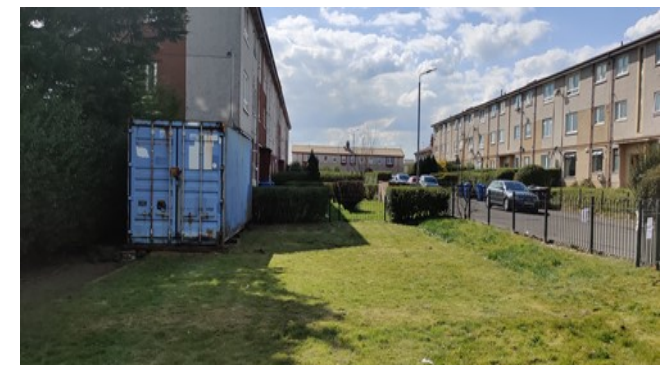
Bedford community garden, Drumry