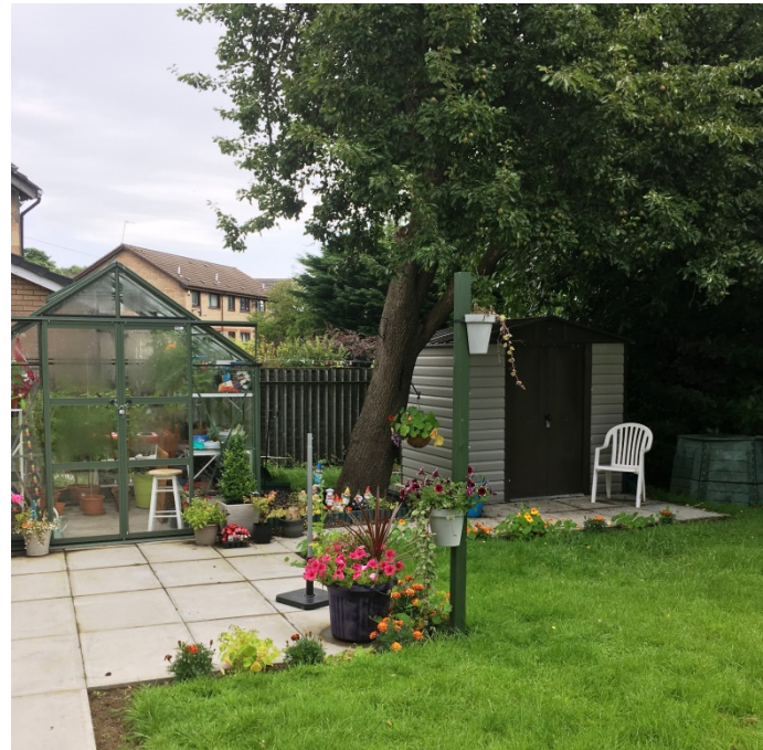
Mill Road new garden shed - greenhouse and raised beds previous year