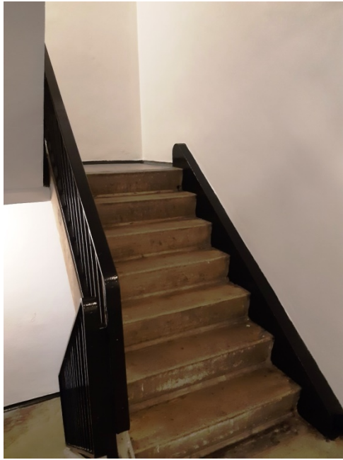
Kilbowie Court back stairs - walls and ceilings painted