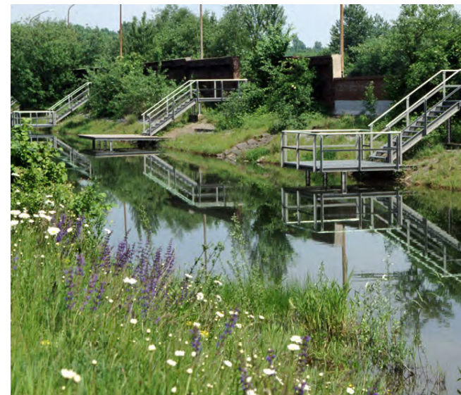
Develop the Waterfront Path