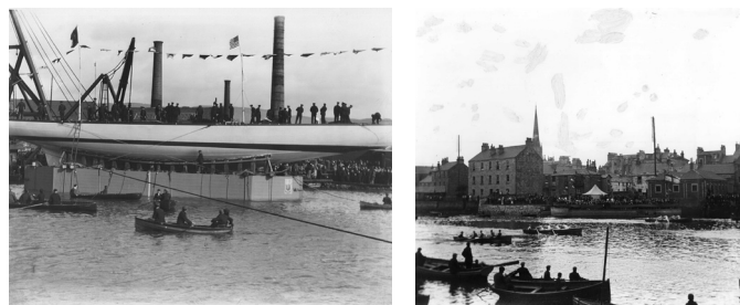
Dumbarton's Heritage is a key under-exploited asset