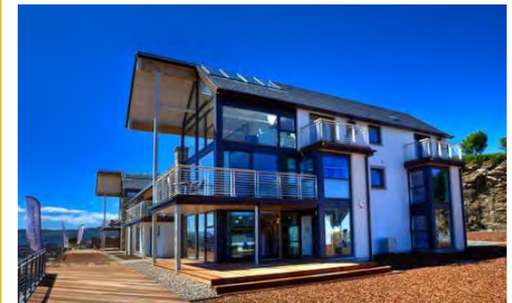
Sandpoint can be a Marine Destination