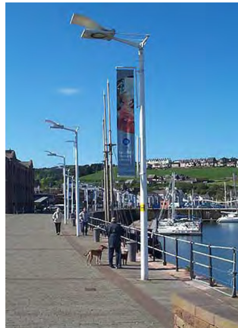
Basin can be a Vibrant Mixed Use Area