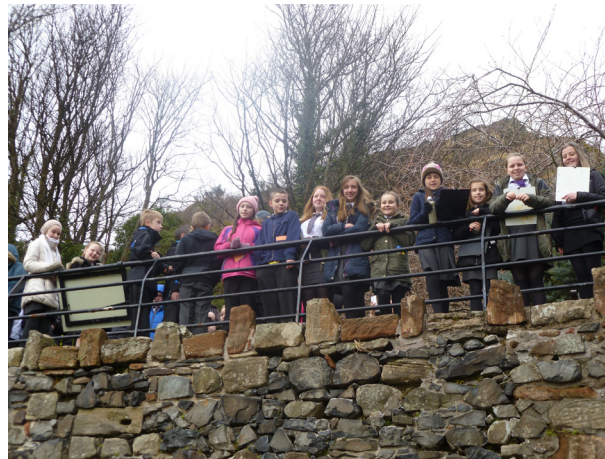
Primary School pupils were involved in Pre-Charrette Workshops.