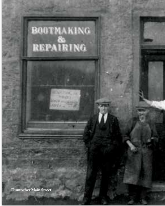
Duntocher Main Street