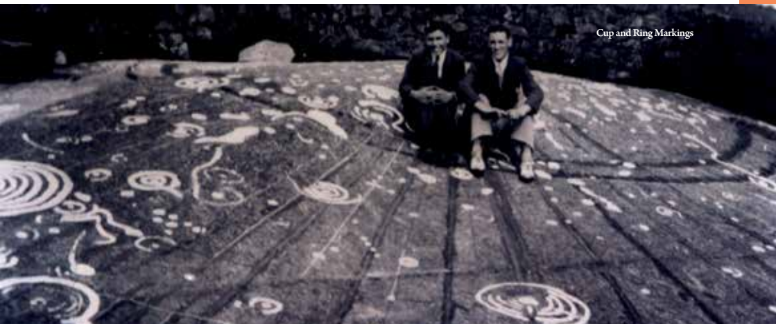
Cup and Ring Markings

In 1887, the Rev Harvey of Duntocher discovered some curious cup and ring markings in rocks to the north of Faifley. Over the next few years others were found. They are thought to be around 5,000 years old and archaeologists are unsure of their purpose. They may have had a religious or astronomical significance or perhaps they had artistic or cultural functions. The photograph shows the biggest of the stones, known locally as the Druid Stone. The markings have been whitened to show them more clearly. Today, because of vandalism, the best of the carvings, including the Druid Stone, have been earthed over for protection by Historic Scotland. One exception is in Auchnacraig Urban Park where an example can still be seen on the site of the former Auchnacraig House.