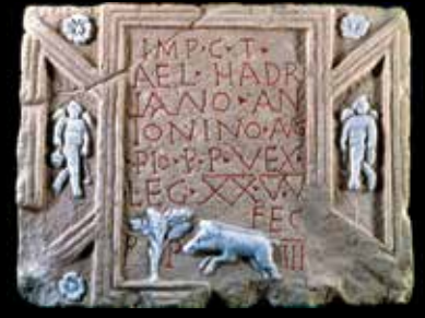
A cast of a Distance Slab of the Twentieth Legion, Hutcheson Hill

An excellent example of a Distance Slab was found close to Braidfield Farm, near Duntocher Fort, in 1812. The slab is decorated with two winged mythological females flanked by two Roman soldiers below the central inscription of: