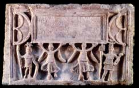
Distance Slab of the Sixth Legion, Braidfield Farm